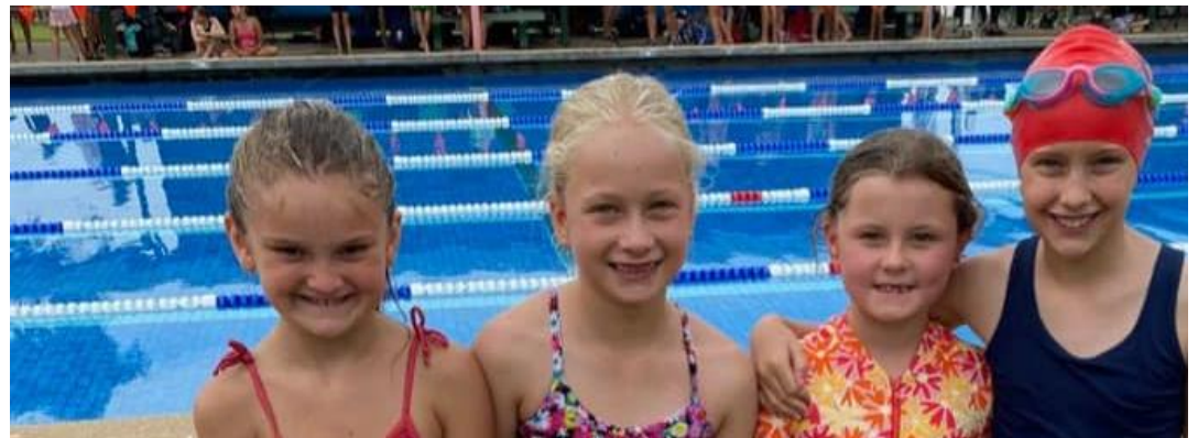
Relay teams for the District Carnival