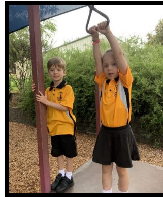
Kindy students settle into school routines beautifully!