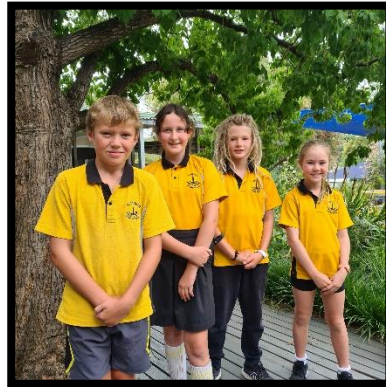
Sport Captains 2023