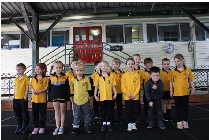
Kindergarten/Year 1 performers