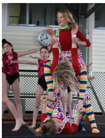
Clowns in Join the Circus