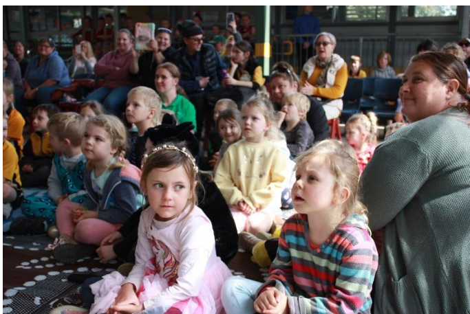
Preschool children and audience