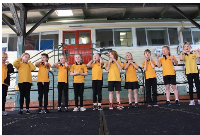
Class 2M Performers