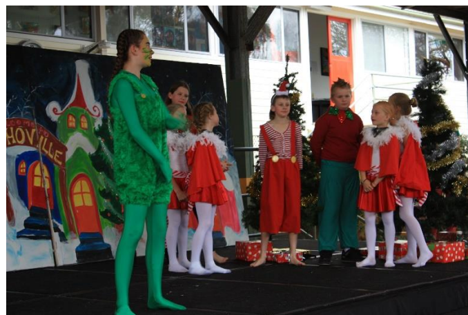
Drama Group - Grinchy Christmas