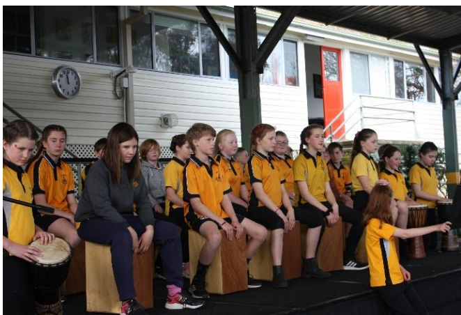
Class 4BJ Performers