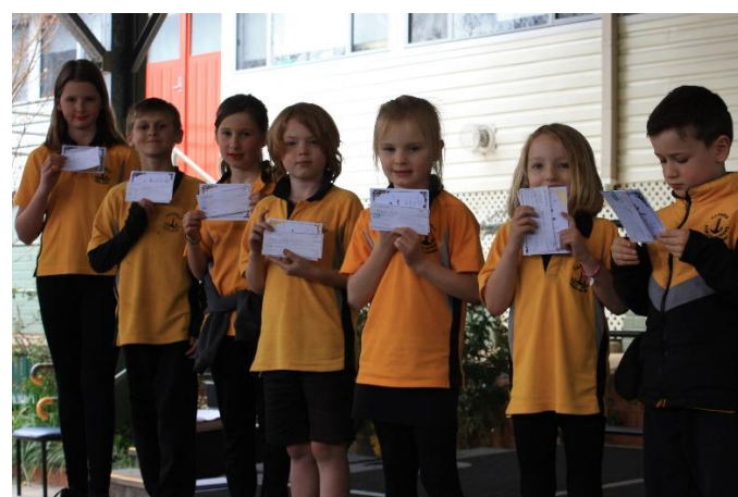
Book Fair Awards for children borrowing from the Library