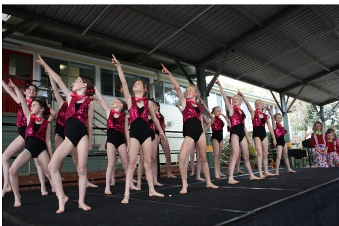
Join the Circus Dance Group