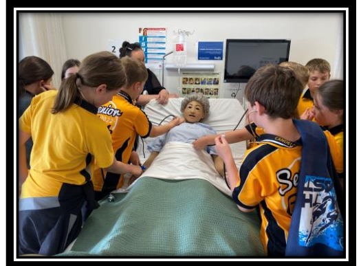
4BJ future doctors and nurses (UoW Bega)