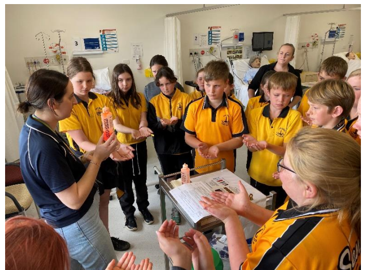
A fun and busy time at the UoW Bega Campus, thanks everyone.

Year 5 are preparing their leadership speeches and will present them to parents and the school at 9.15am Tuesday 29 November (while Year 6 are at Bega HS transition).