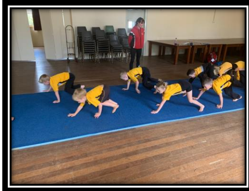
Gymnastics with 1W in the Hall

Attachments Eden Area Gymnastics Permission Slip